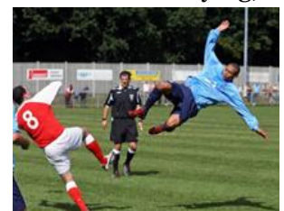
You won't find this in the coaching manuals

Today the two-footed tackle is considered to be Satan's work that is destroying the moral fibre of society, plus contributing to a melting of the polar icecaps and footballers caught performing two-footed tackles are treated worse than rapists.